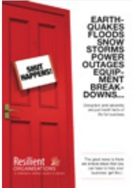
Shut Happens: A Resilience guide for small business