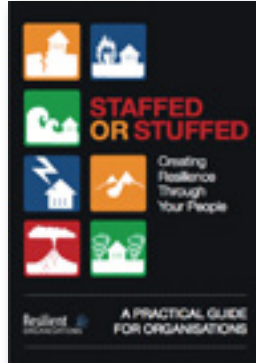
Staffed or Stuffed: Creating resilience through your people