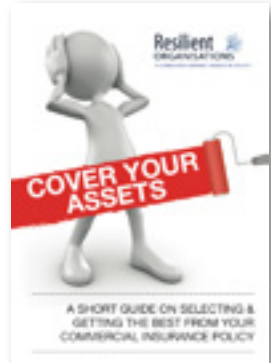
Cover your Assets: Selecting and getting the best from your Commercial Insurance Policy