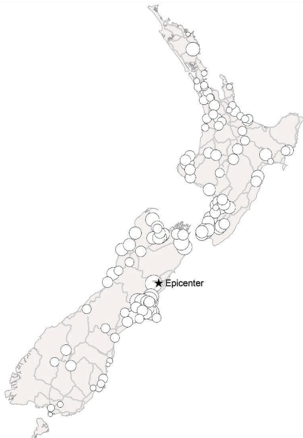
Figure 1. Shaking intensity reported by the public using GeoNet Felt Reports following the Kaikoura earthquake. Reproduced from Felt Reports by GeoNet, 2016, Wellington, New Zealand. Copyright 2016 by the Earthquake Commission and GNS Science. Reproduced with permission.

notably in Waiau and Cheviot, experienced damage to community and residential structures and disruptions to water and electricity supplies.